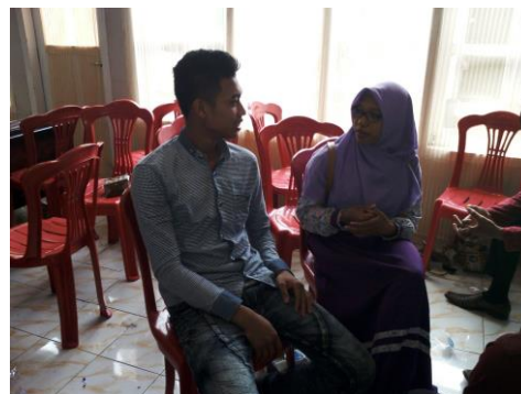
Figure 6. Group and Individual Counseling Activities.

Coaching using the integrated Islamic learning model had been carried out based on five main contents. Several previous research only focused on one content in coaching. However, this integrated Islamic learning model combined several contents, such as religious knowledge, general knowledge, civic education, skills, and counseling.