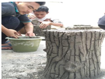
Figure 5. Softskill Training of Making Flower Pots.