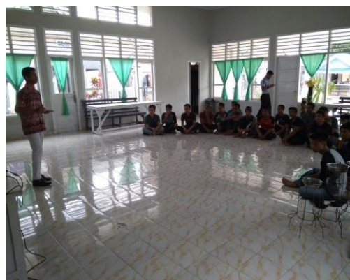
Figure 2. Delivering Islamic Material and Preaching Activity.

Islamic material to children in conflict with the law at Class IIA Curup Correctional Institution was delivered in collaboration with IAIN Curup's Islamic Student Activity Unit (UKM). The students provided enlightenment and direction about attitudes and values in the form of good morals. They then motivated the children in conflict with the law not to fall back into prohibited actions that can harm themselves and their families.