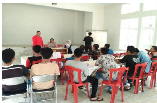
Figure 4. Civic Education Materials.

The civic education materials were carried out by researchers in collaboration with the Rejang Lebong police officers. These activities were carried out by explaining the importance of the Law and Pancasila as the basis of the state, explaining the importance of the unity of the Republic of Indonesia, and preventing conflicts and problems that arise in society. The following is the image of the activity.