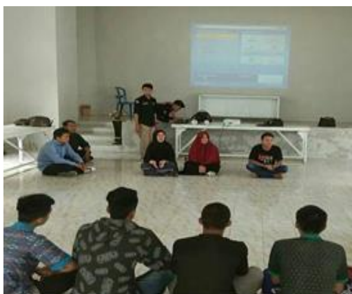
Figure 3. Providing General Knowledge Materials.