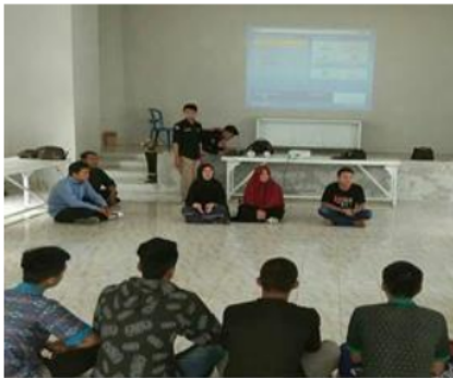
Figure 3. Providing General Knowledge Materials.