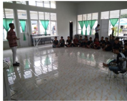
Figure 2. Delivering Islamic Material and Preaching Activity.

The material provided in the religious development aimed to produce Muslims to recognize their religion and God, have the morals of the Quran and become better human beings (Yusuf & Sterkens, 2015). The Islamic material presented was fiqh material where the children in conflict with the law learn the correct ablution procedures, prayer procedures and also practices the burial rituals.