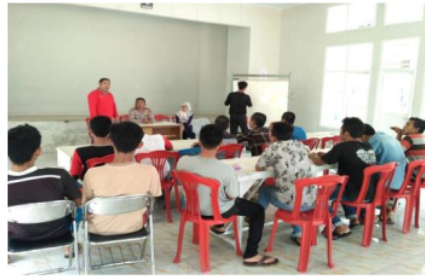
Figure 4. Civic Education Materials.

The civic education materials were carried out by researchers in collaboration with the Rejang Lebong police officers. These activities were carried out by explaining the importance of the Law and Pancasila as the basis of the state, explaining the importance of the unity of the Republic of Indonesia, and preventing conflicts and problems that arise in society. The following is the image of the activity.