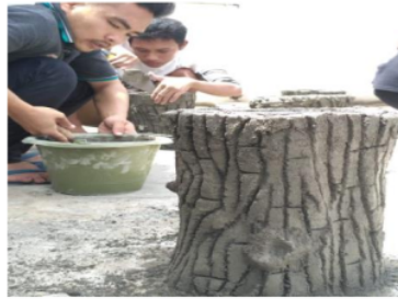
Figure 5. Softskill Training of Making Flower Pots.