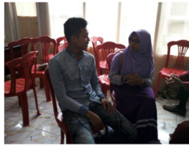
Figure 6. Group and Individual Counseling Activities.

Coaching using the integrated Islamic learning model had been carried out based on five main contents. Several previous research only focused on one content in coaching. However, this integrated Islamic learning model combined several contents, such as religious knowledge, general knowledge, civic education, skills, and counseling.