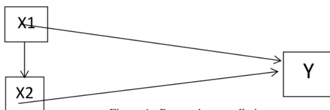
Figure 1: Research constellation

17 This research used a quantitative approach, survey method with Path Analysis technique. This research was conducted in Curup City of Rejang Lebong Regency, Province of Bengkulu, as the analysis unit of STAIN Curup lecturers. There were 112 lecturers of STAIN Curup that became samples of this research. The research time started from preparing the proposal on September 2016 to the conduct 29 of the research in August 2017. The data were collected from March 2017 until August 2017. The variables in the path analysis consisted of exogenous variable and endogenous variable with the following research constellation presented in figure 1: