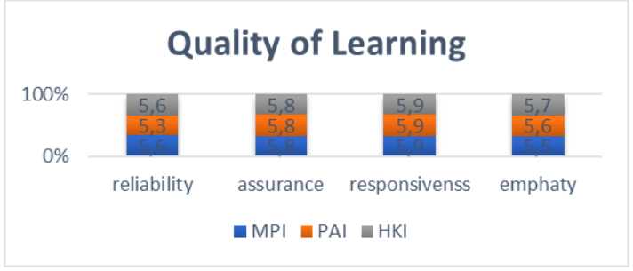
Figure 2 Quality of learning

In the learning service variable, the results of the study show that this research is also different from the results of previous studies which were used as a literature study. The dissimilarity of research results is also influenced by the demands of learning that take place in the post-graduate program of IAIN Curup, where the estimated parameter between the learning quality variable and the student satisfaction variable shows significant positive results with a significant level value of 5%. Thus, hypothesis II can be accepted, meaning that the service quality variable has a positive effect on the student satisfaction variable in this study, which is proven empirically.