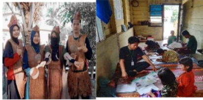
The picture of implementation of the community service program

implementing congregational prayers in the mosque, lack of enthusiasm of young people in advancing the village.