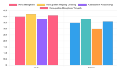
Figure 2. Comparison of discipline levels between teachers and students in four regions

These findings suggest that while teachers and students differ in their views on the culture of discipline, regional differences do not appear to have a meaningful impact. This supports the conclusion that Islamic education contributes to shaping a culture of discipline within the school setting, regardless of geographical location.